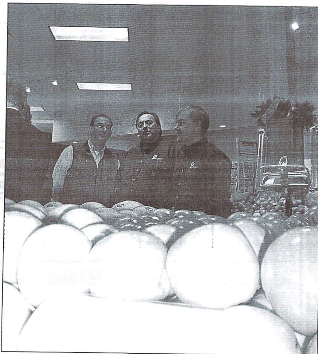
Friendly Foodie's vendors show off their fruit!